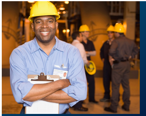
Visit this link for the OUTREACH ORDER FORM: www.sbeinc.com/services/ diversity_outreach.cfm

At our discretion, 100% Payment and 100% Performance bonds may be required as a subcontract condition. This will be a PREVAILING WAGE JOB. DGC is an Equal Opportunity/Affirmative Action Employer.